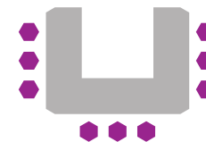
U Shape 20 people