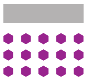
Theatre 200 people